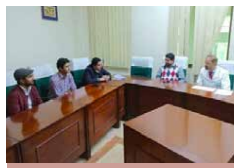
FCPS Community Eye Health training module