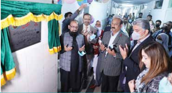
Inauguration of play area in Pediatric Ophthalmology