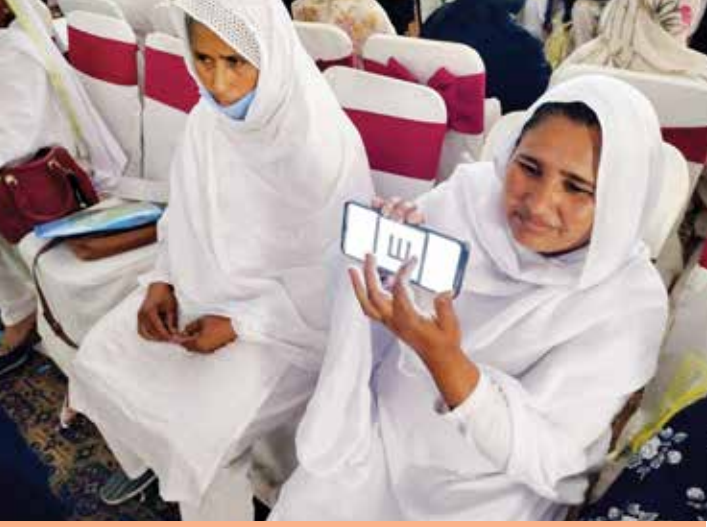
Household Eye Screening LHWs Training for 338 LHWs under one roof. This the great achievement under COAVS Community department done in collaboration with CBM.