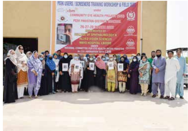
Training of Lady health Visitors of Tehsils Choa Saidanshah and Chakwal on primary eyecare & Peek screening tool in collaboration with CBM