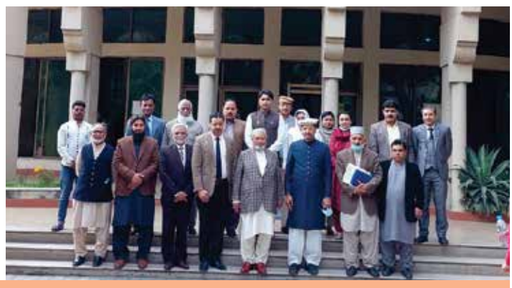
Inauguration of Prayer Place and Daycare Center by Syed Habib Irfani, Member Council of Islamic Ideology