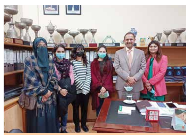
Visit of University of Engineering & Technology students (Architect Department) to Institute of ophthalmology and COAVS on project of designing an eye care center