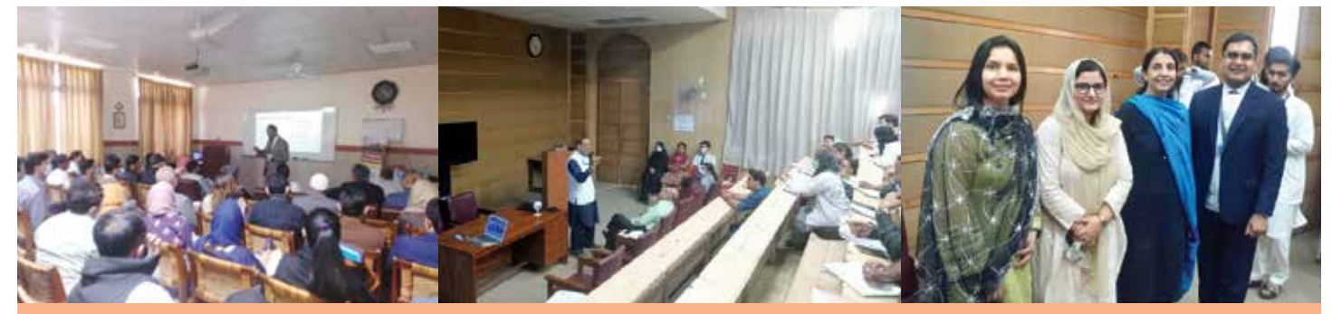
Ophthalmology Orientation Sessions during postgraduate preparatory course in Neurology department, certificate in Family Medical Physician and other programs.