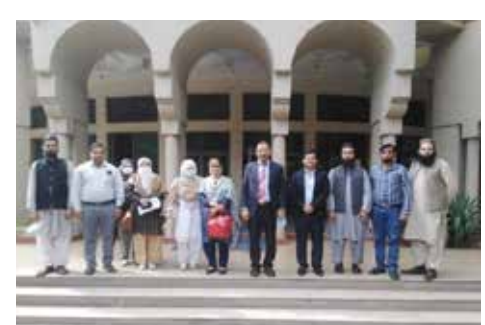
Meeting with team from Center of Excellence in Molecular Biology (CEMB) on stem cell research in ophthalmology