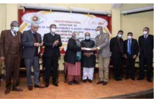
INGOs, CBM , Germany & Sightsavers Int. released grant of worth 104 million PKR to COAVS for state-of-the-art equipment, infrastructure and training items.