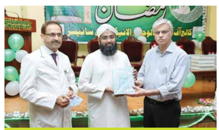
Isataqbal-e-Ramadan to guide students on how to maximize utilization of time with studies and duties.