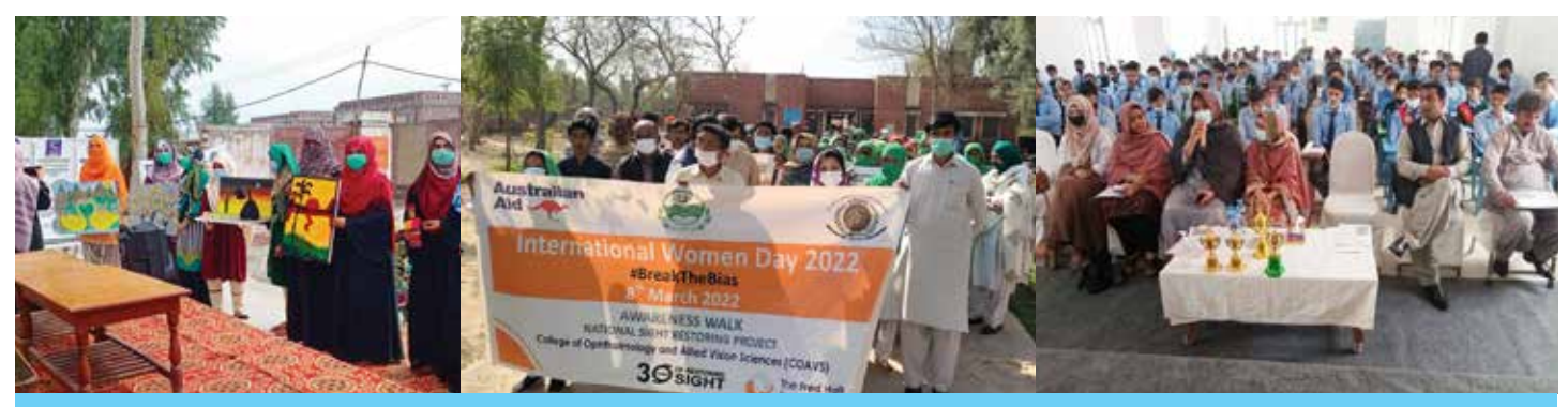
"International Woman day" celebrated under National Sight Restoring Program (NSRP). Events organized by the COAVS, in collaboration with FHF in DG Khan, Mianwali and Khushab