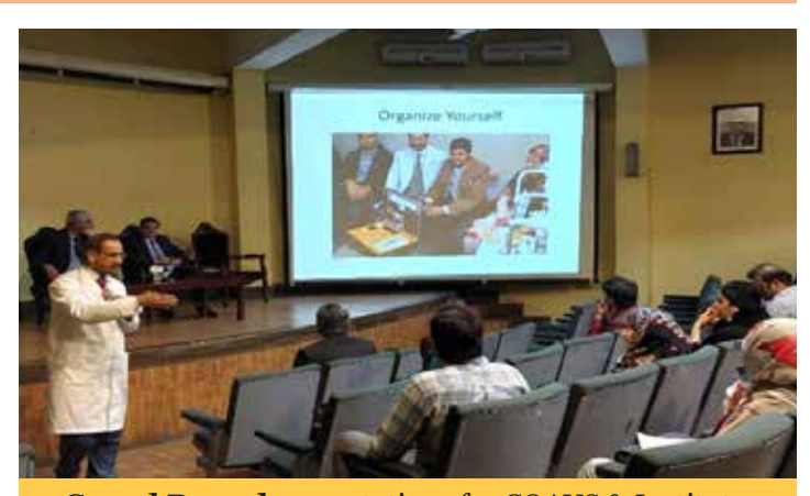
Grand Round presentations for COAVS & Institute of Ophthalmology