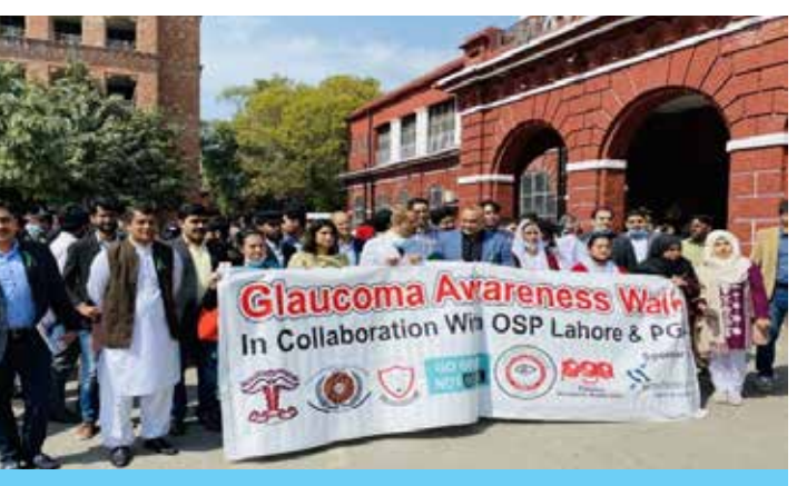
Glaucoma Awareness Walk in Collaboration with OSP and Pakistan Glaucoma Association