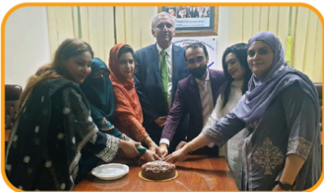
World Optometry Day, 2023