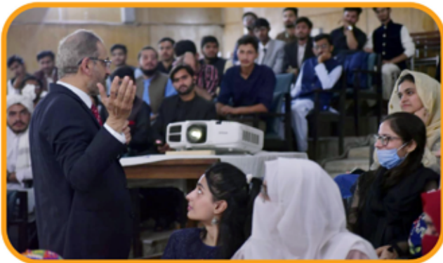
Orientation Session for 13 Medical Technologies, 1st Year, BSc, King Edward Medical University