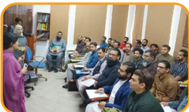
3-month Opticianry Refresher by Sooops & LAO