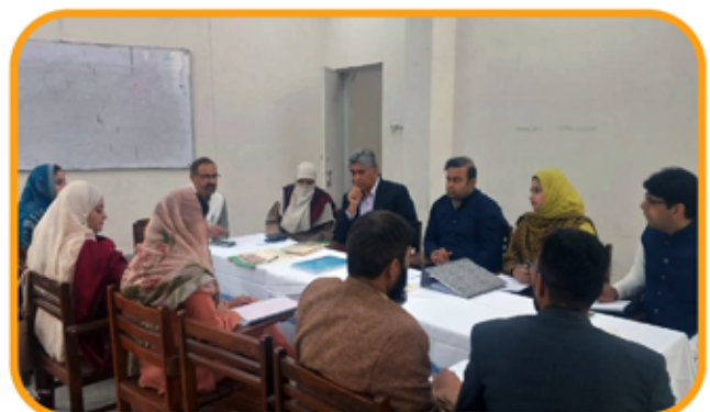
Audit meeting of the QEC, COAVS- KEMU & submission of self-Assessment Reports