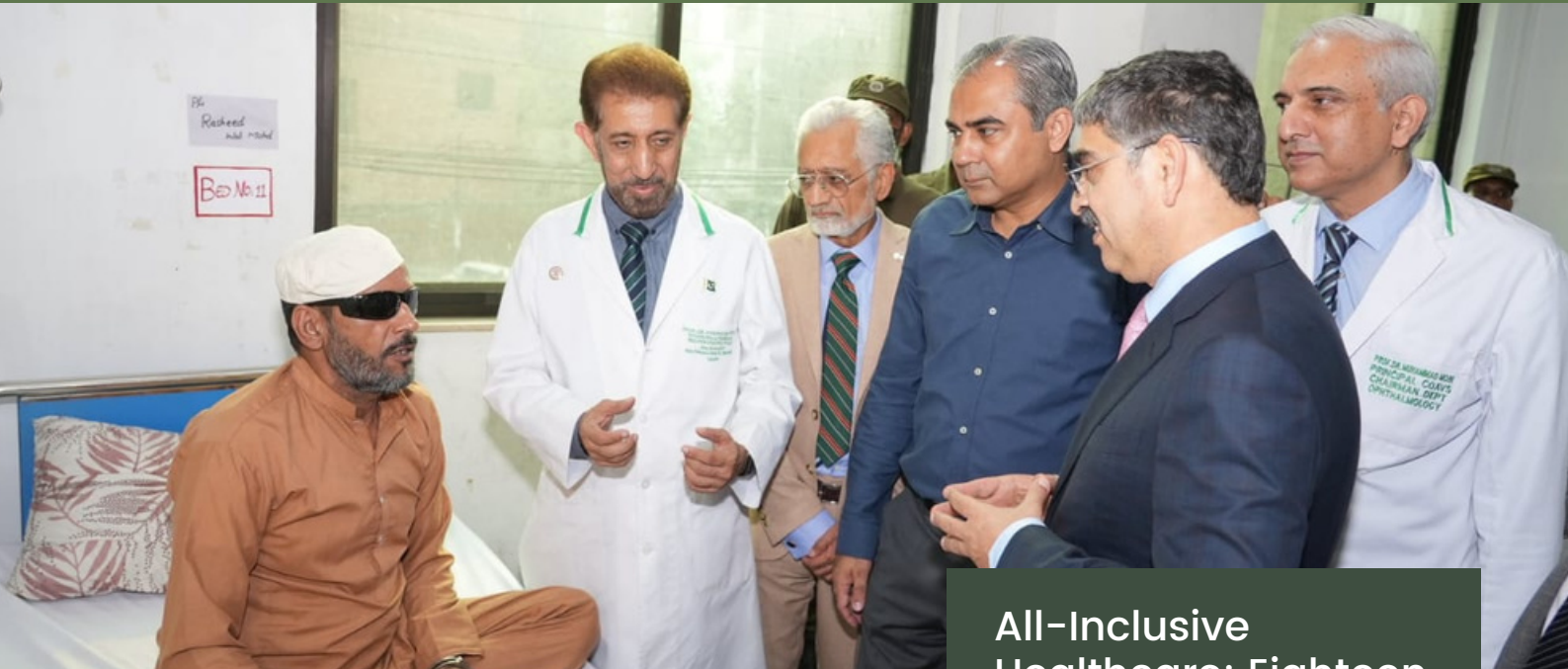
Prime Minister Pakistan, Mr. Anwaar-ul-Haq Kakar, visited the patients.

All-Inclusive Healthcare: Eighteen Prisoners Received Treatment for Blinding Cataracts