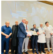
Eye Screening at KEMU with Hon. Minister Khawaja Imran Nazir

World Sight Day Celebrations & Launch of Pakistan Inclusive Eye Health Project, Sargodha in Collaboration with Sightsavers, 7 th Oct, 2025; Launching graced by Hon. Minister Khawaja Imran Nazir