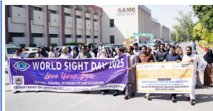
WSD Awareness walk Quid e Azam Medical College Bahawalpur