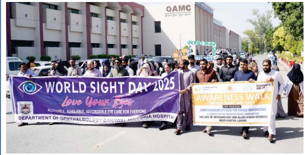
WSD Awareness walk Quid e Azam Medical College Bahawalpur