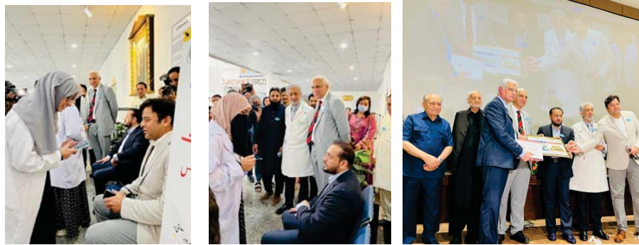
Eye Screening at KEMU with Hon. Minister Khawaja Imran Nazir

The ceremony marked the launch of the Cataract Project , being implemented in collaboration with CBM, to provide cataract surgeries and essential eye-care services across 42 hospitals in 29 districts of Punjab.